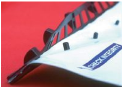
Plastic Closure Seal