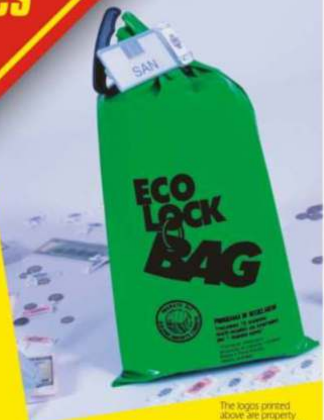
Ecolock Bag with label-holder Lever lock

The logos printed above are property of its respective users.