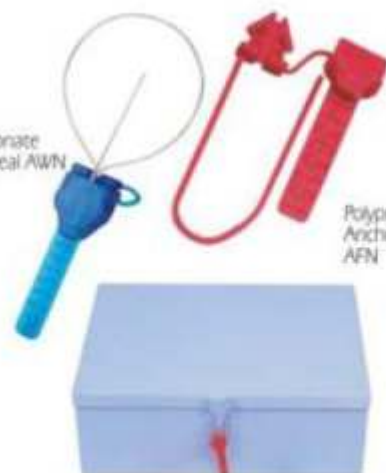
Polypropylene Anchor seal AFN