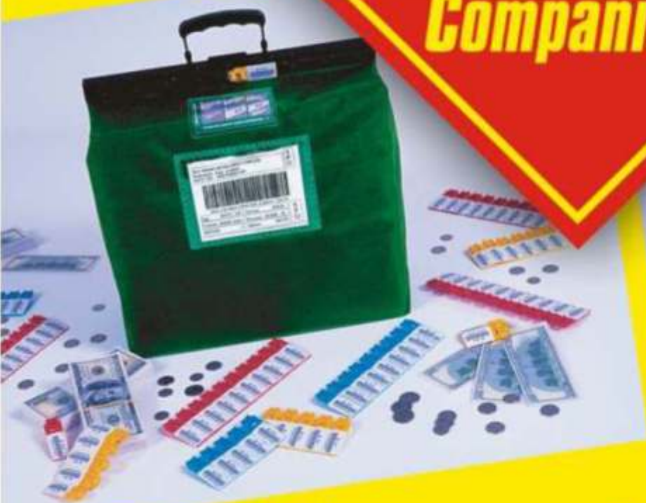
Reusable Snapseal Bag

Products for Banks and Armored Car Companies