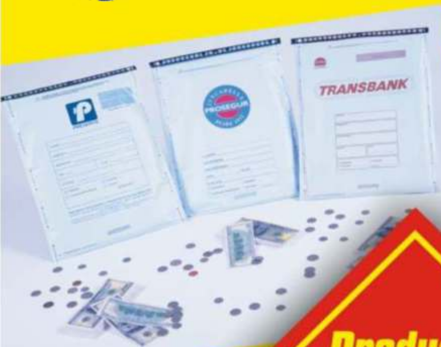
Starlock Plastic Bags