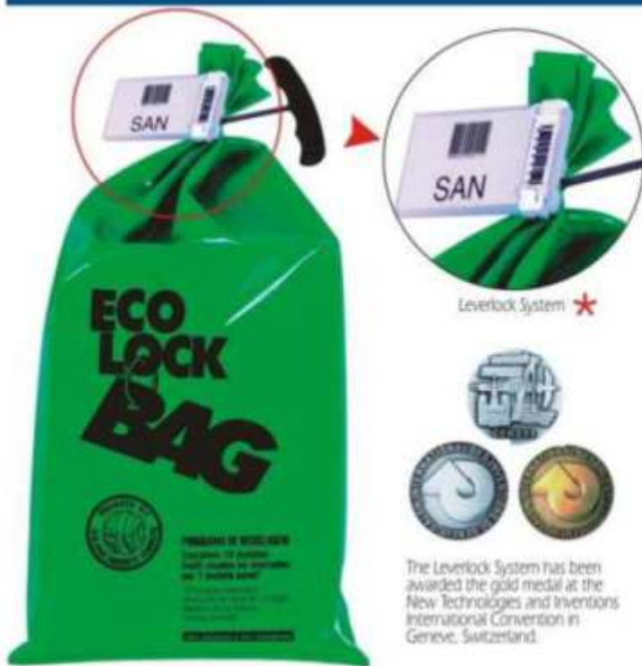
Leverlock System ★