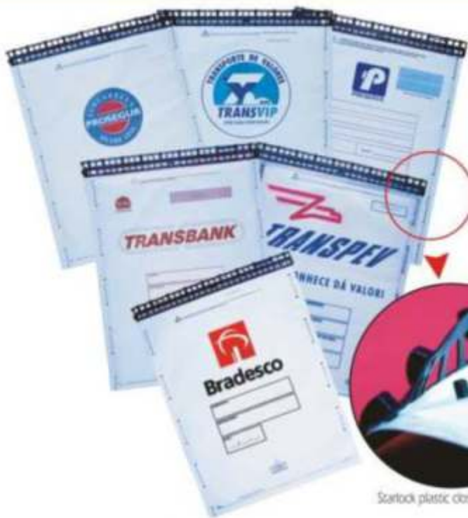
Starlock plastic closure system